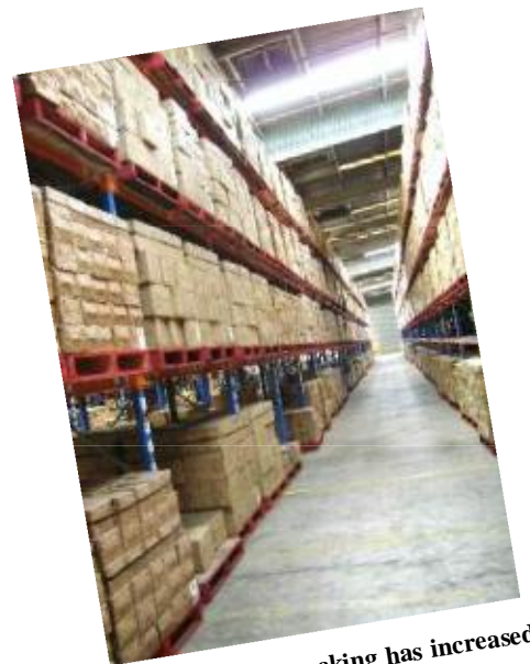
Smash's new racking has increased storage space dramatically