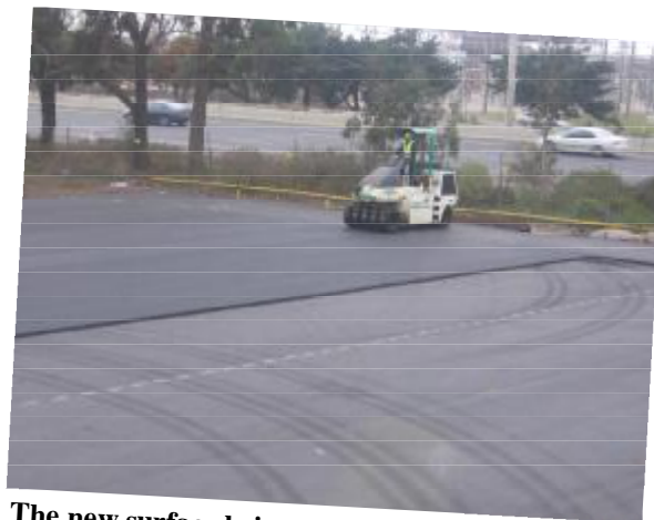
The new surface being paved at our Link Crt depot in Brooklyn

Obviously the purchase of this type of equipment puts any yard surface to the test and our experience was no different. Immediately following the purchase of the first Reach Stacker a contractor was engaged to upgrade the back yard area at the Altona North depot. Due to the size of the yard and the space available it did not pose too many traffic or logistical problems and the work was completed over a 2 week period without much disruption. So far the result has been excellent with the new surface showing no signs of faltering under the weight.